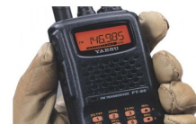
Your VHF/UHF radio (technically HF works too..)