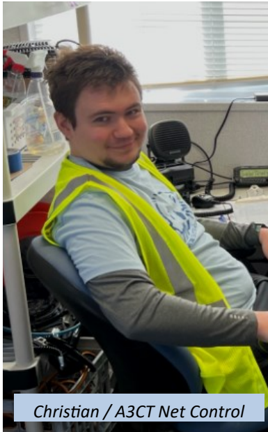
Christian / A3CT Net Control