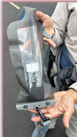
HF HT Icom M-73 used by crew in its water proof case (it rains a lot here!)