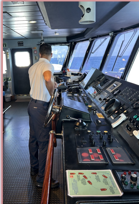
Bridge of the National Geographic Endeavor 2