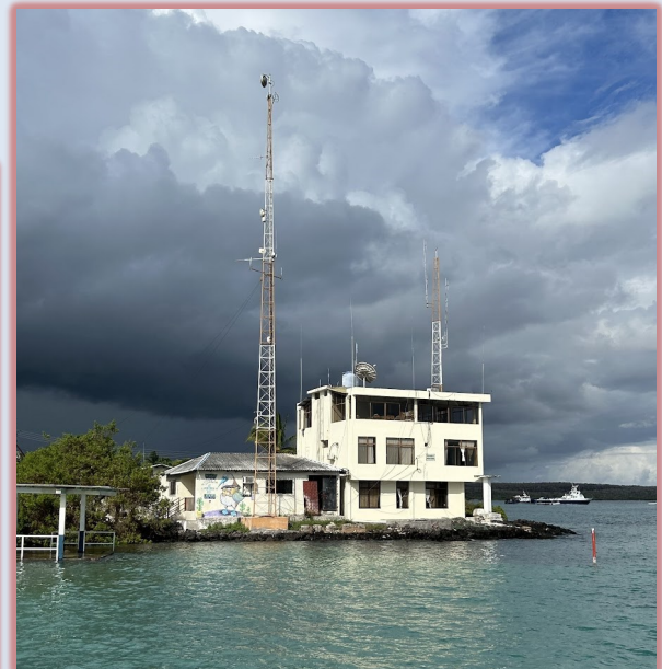
Harbor Authority at San Cristobal