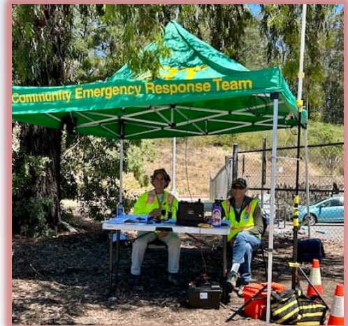
ARES and CERT manning the command post

This was the first time using Aptos High School and it again encompassed a much larger footprint for perimeter monitoring. The campus is nestled into the Aptos hills and housing developments on both sides of the campus. Prior years the event had been at San Lorenzo Tri-campus School (elementary, junior high and high school), Scotts Valley High School and UCSC. Similar to last year, this year had some additional activities on-going during the same time as the event at the campus location. This included construction, athletics practice, maintenance crews and teachers getting ready for the upcoming year. New this year was a bumper crop of poison oak and a skunk spontaneously volunteering to manage the main gate and keeping away the additional unwanted visitors.