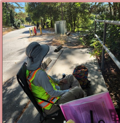
Monitoring the back side of campus